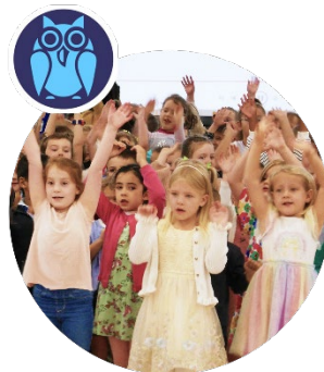
Owlsmoor Primary School