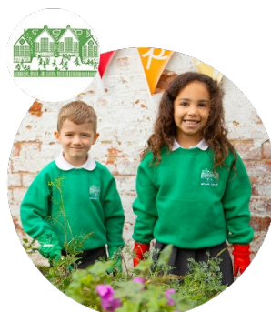
Wescott Infant School