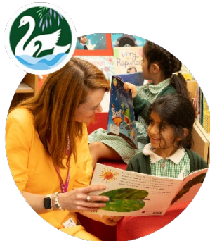
Emmbrook Infant School