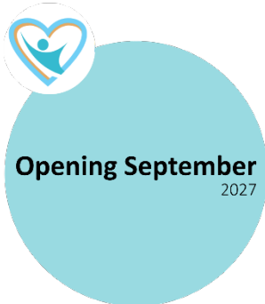
Hartland Primary School