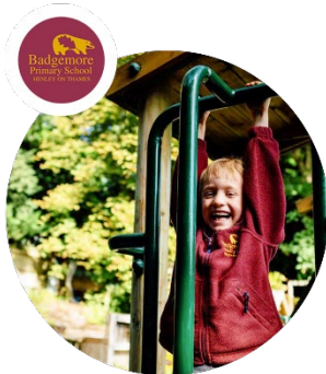
Badgemore Primary School

As a trust we are rooted in this approach and our ambition is clear; to improve the educational outcomes for children and young people. We don't want to change schools; we want to help them progress.