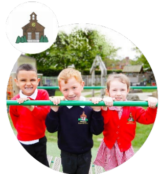
Shinfield Infant and Nursery School