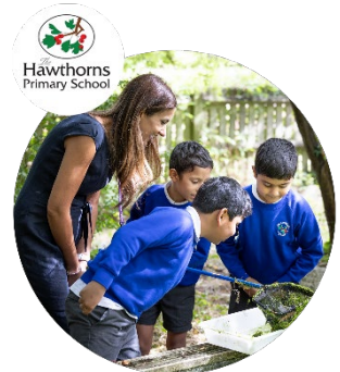
The Hawthorns Primary School