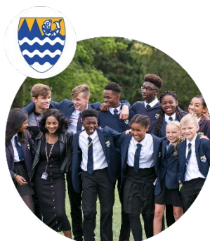
The Emmbrook School