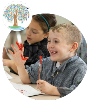
Emmbrook Junior School