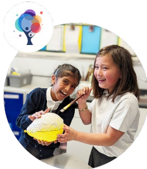
Nine Mile Ride Primary School