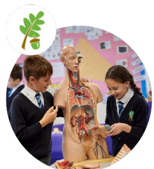
Westende Junior School